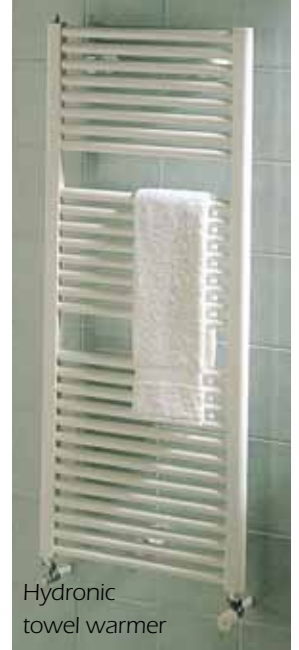
Hydronic towel warmer

An additional advantage of towel warmers is that they generate heat, so they can easily keep a bathroom warm, according to Pat Kahnert of Marathon Intl., which offers the BAXI line of towel warmers. The different sizes available allow for enough heat output for the towel warmer to be used either as a supplemental heater or as the sole source of heat for that room.